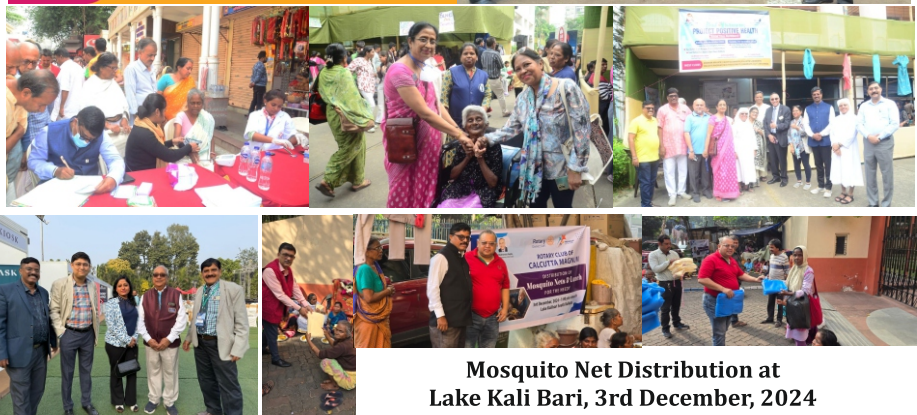
Mosquito Net Distribution at Lake Kali Bari, 3rd December, 2024

We meet 1st & 3rd Wednesday 7.30 pm at 'OUTRAM CLUB'