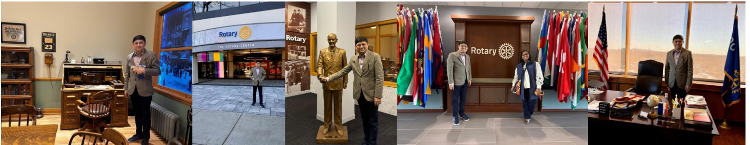
Members Visit to One Rotary Center Chicago, 1st November, 2024