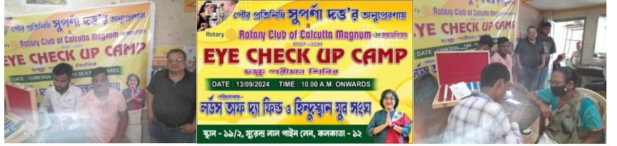
Eye Check Up Camp, 13th September, 2024