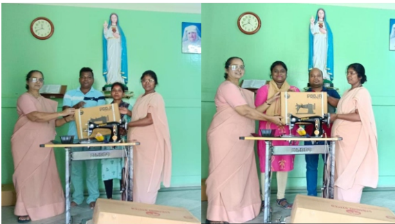
Sewing Machine Distribution at Shanti Rani Home, 3rd November, 2024