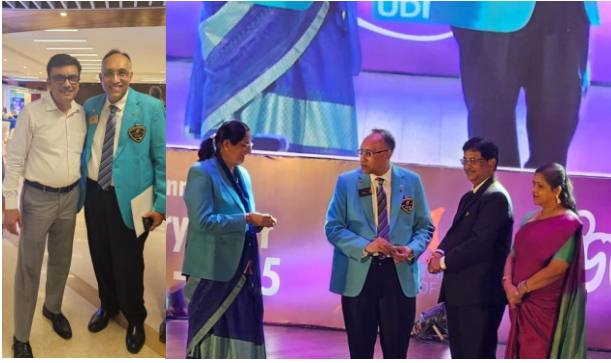
Changeover Ceremony, 1st July 2024