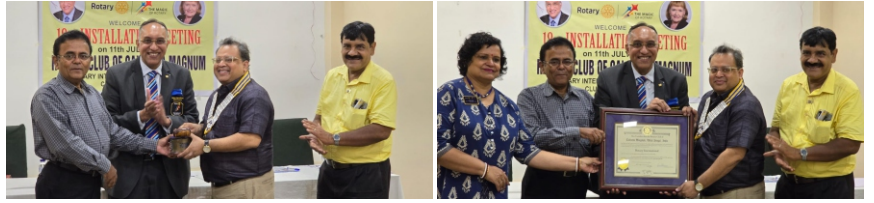
18th Installation Meeting, 11th July 2024