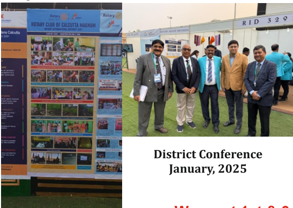
District Conference January, 2025