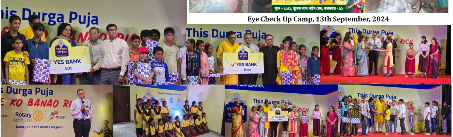
New Cloth Distribution in association with YES BANK on 2nd October, 2024